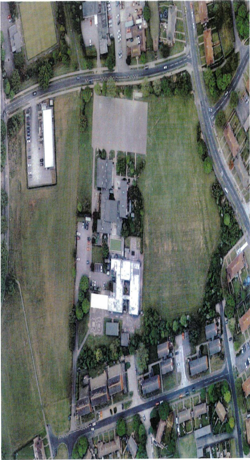
Grange Infant School February 2015 18