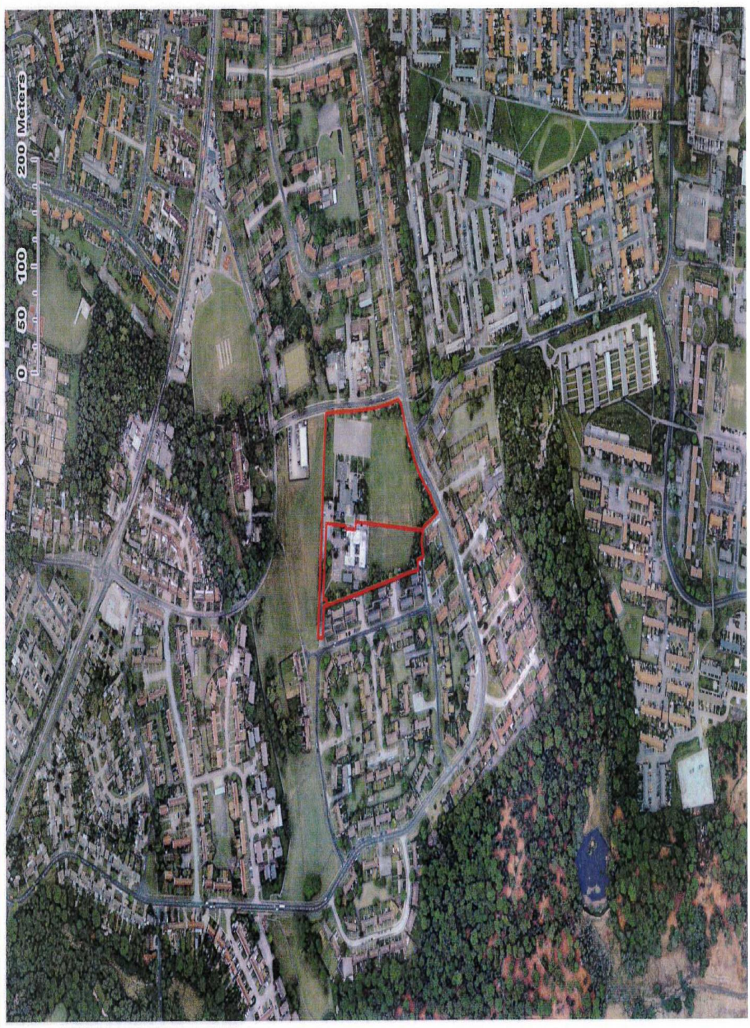
Grange Infant School February 2015 19